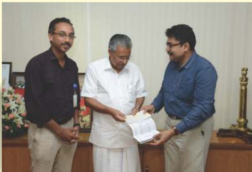
KOA handover INR:36,50,000 for the Kerala CM Flood Relief Fund