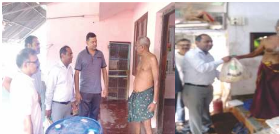
Flood Relief Kit Distribution at Puthenvelikkara, Paravoor, under the aegis of the President of Cochin Orthopaedic Society

Presidents Theme National: Train the young to enrich the future State: Our Health, Our Infrastructure