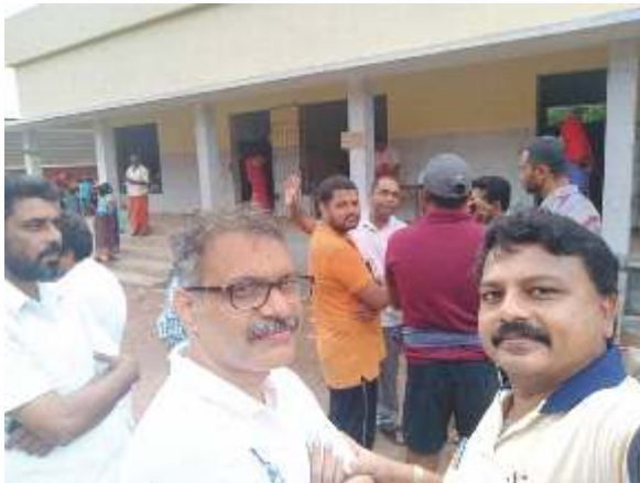
COS Medical Team at Manjali Camps