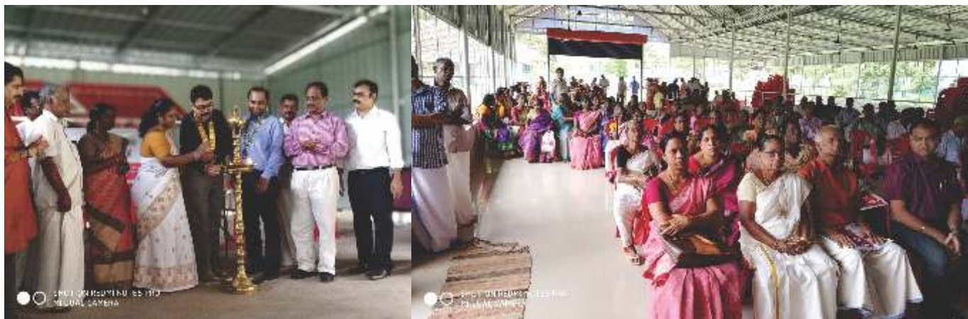
COS Medical Camp at Udayanapuram, Vaikom, in association with National Bone and Joint day 2019